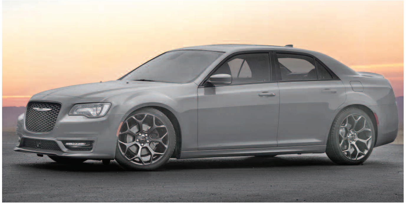
For 2017, the Chrysler brand is updating its bold and blacked-out Chrysler 300S model with even more athletic and aggressive styling appointments.

Standard with the 300S V-8 model, and available on the 300S V-6 model, the new Exterior Sport Appearance Package features a more aggressively styled front fascia with larger air intakes and integrated LED fog lamps highlighting the 300S model's world-class handling and levels