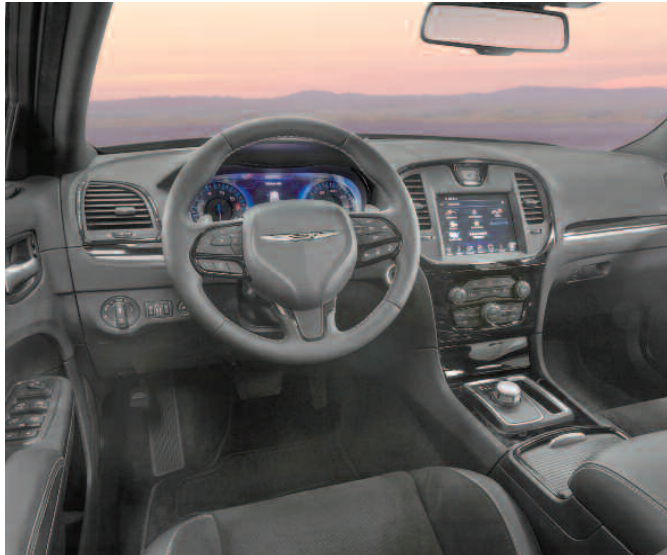
The Interior Sport Appearance Package takes the Chrysler 300S model's sport-contoured leather seating and upgrades it for more cradling and comfort.

of technology. These fog lamps are exclusive to the Exterior Sport Appearance Package and are comprised of a strip of eight horizontal LEDs each, for an even more distinctive signature look at night.